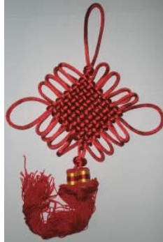
Chinese Trinity Knot

For 2019, the wealth sector is at the east sector. You need to hang a Chinese Trinity Knot at this sector.