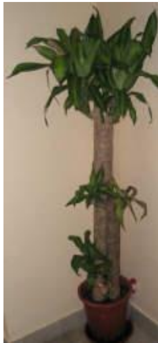
Tie Shu (铁树)

For 2019, the sickness and bad luck sector is at the SW sector. You need to put a pot of plant at this sector. You can put a pot of Tie Shu (铁树) (scientific name: Dracaena Fragrans )